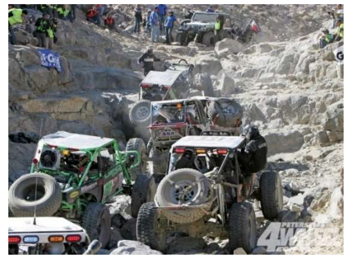
11<sup>th</sup> Holcomb Valley Snow Run run (E) leader Rob Rien

Next to Valley Vista Airport. take hwy 247 Old Woman Springs Rd to Valley Vista Road turn south to the end turn left at the airport (do not drive on airport runway) about 100 yards, turn right another 100 yds to Lark Ranch.